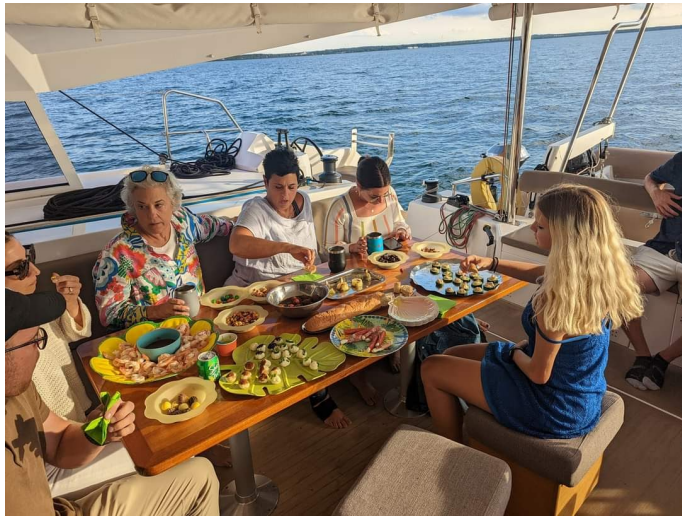
PHYSICAL DISABILITIES FUNDRAISER