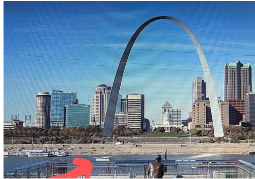
ST. LOUIS ARCH