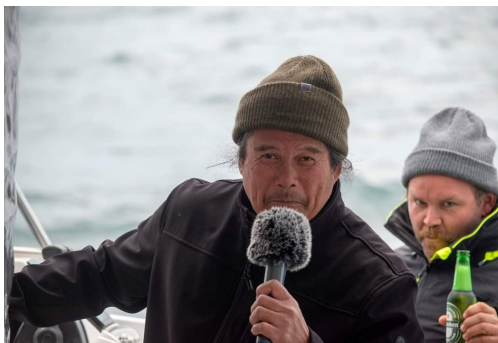
KARAOKE OF COURSE