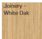
Joinery - White Oak

Interior woodwork in Alpi White oak Walnut nature Flooring GRP - White Headliner Silvertex Macadamia